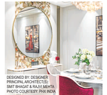
DESIGNED BY: DESIGNER PRINCIPAL ARCHITECT(S): SMIT BHASKAR & RAJVI MEHTA

Use small mirrors to reflect light fixtures and other illumination sources throughout your home. This design gives the illusion that there is more natural light.