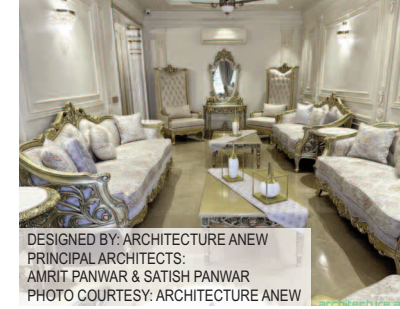
DESIGNED BY: ARCHITECTURE ANEW PRINCIPAL ARCHITECTS: AMRIT PANWAR & SATISH PANWAR

The interior design of your home is a reflection of who you are and what your taste is. Ideally, you want your home to feel like a sanctuary. It should be comforting, inviting, and inspiring. Here are a few tips from South Florida luxury furniture store, Venicasa, to help you achieve this Luxury Interior Design Tips by Venicasa.